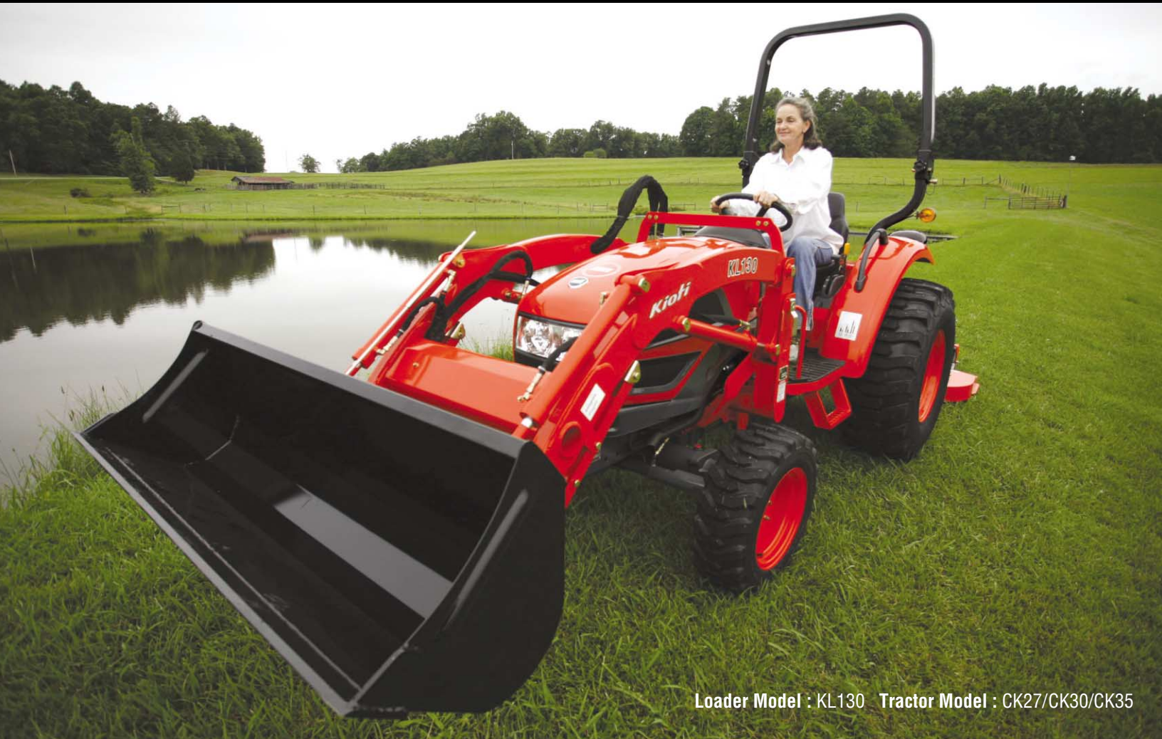
Loader Model : KL130 Tractor Model : CK27/CK30/CK35