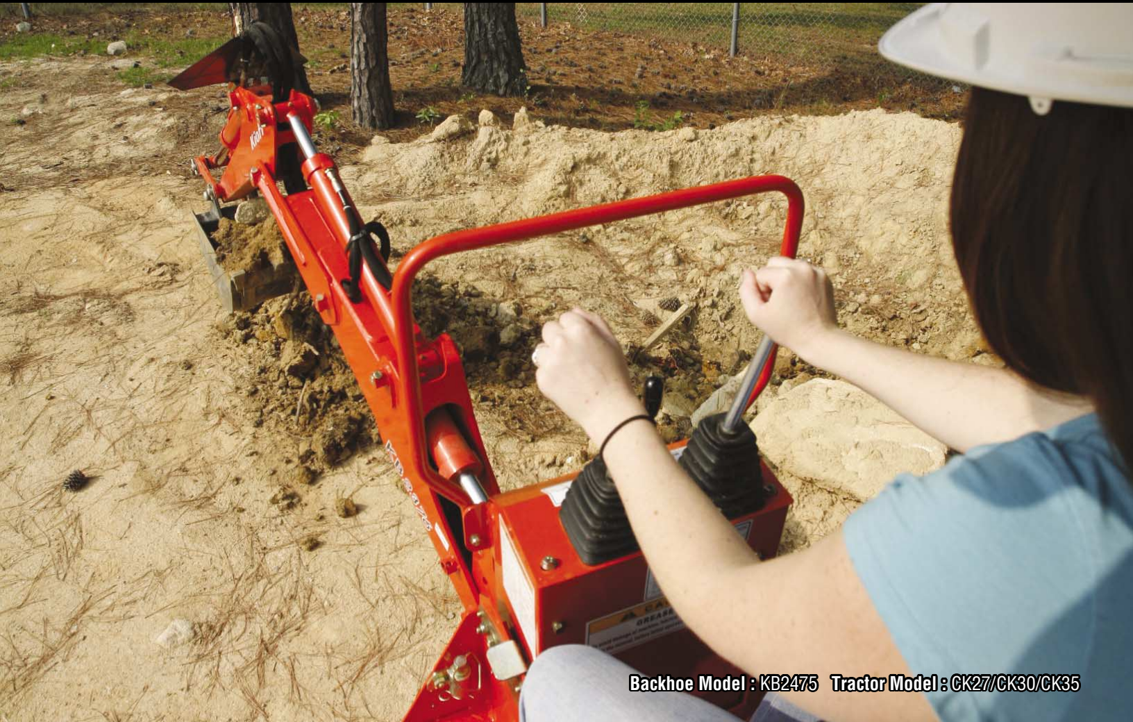
Backhoe Model : KB2475 Tractor Model : CK27/CK30/CK35